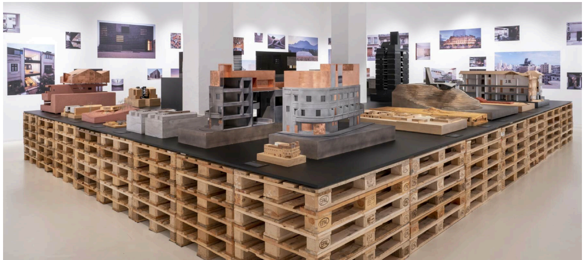
neri&hu opens 'reflective nostalgia' exhibition at aedes architecture forum in berlin